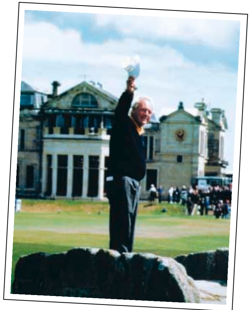
Arnold Palmer on Swilcan bridge, Farewell at 1995 British Open

Arnold Palmer missed achieving the grand slam by finishing second in the PGA Championships in 1964, 1968 and 1970.