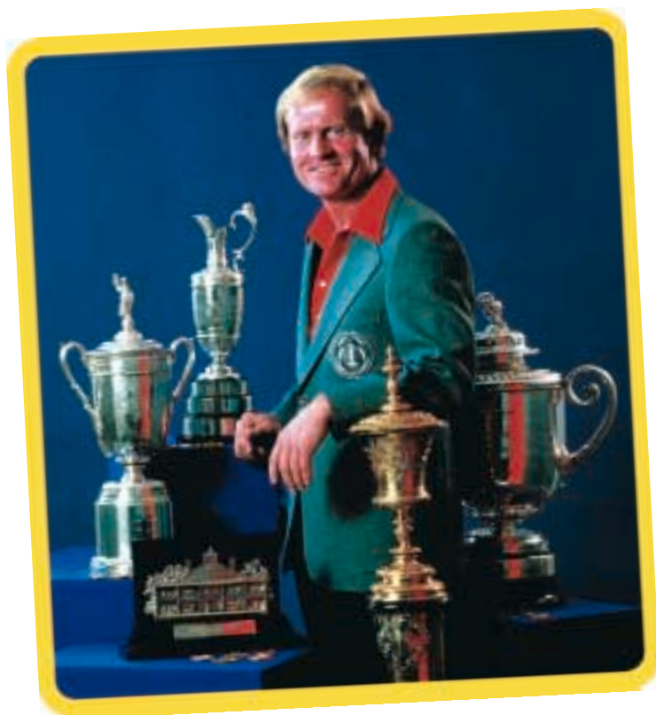
Jack Nicklaus in 1979 with Major Championship trophies, Sportsman of the Year

Dramatic come from behind victory to win by one stroke over Greg Norman and Tom Kite. Becomes the oldest major champion at age 46.