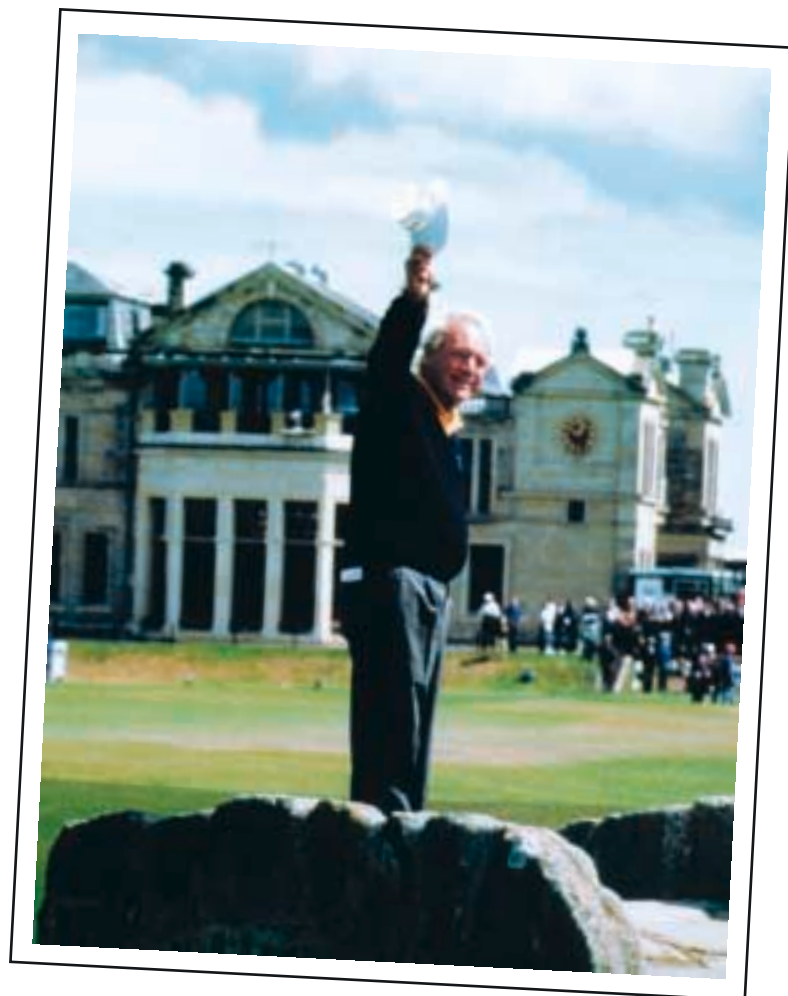
Arnold Palmer on Swilcan bridge, Farewell at 1995 British Open

Arnold Palmer missed achieving the grand slam by finishing second in the PGA Championships in 1964, 1968 and 1970.